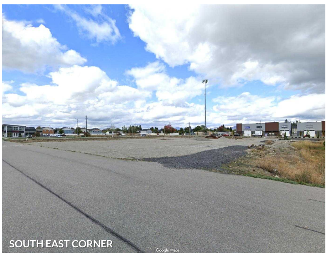
SOUTH EAST CORNER