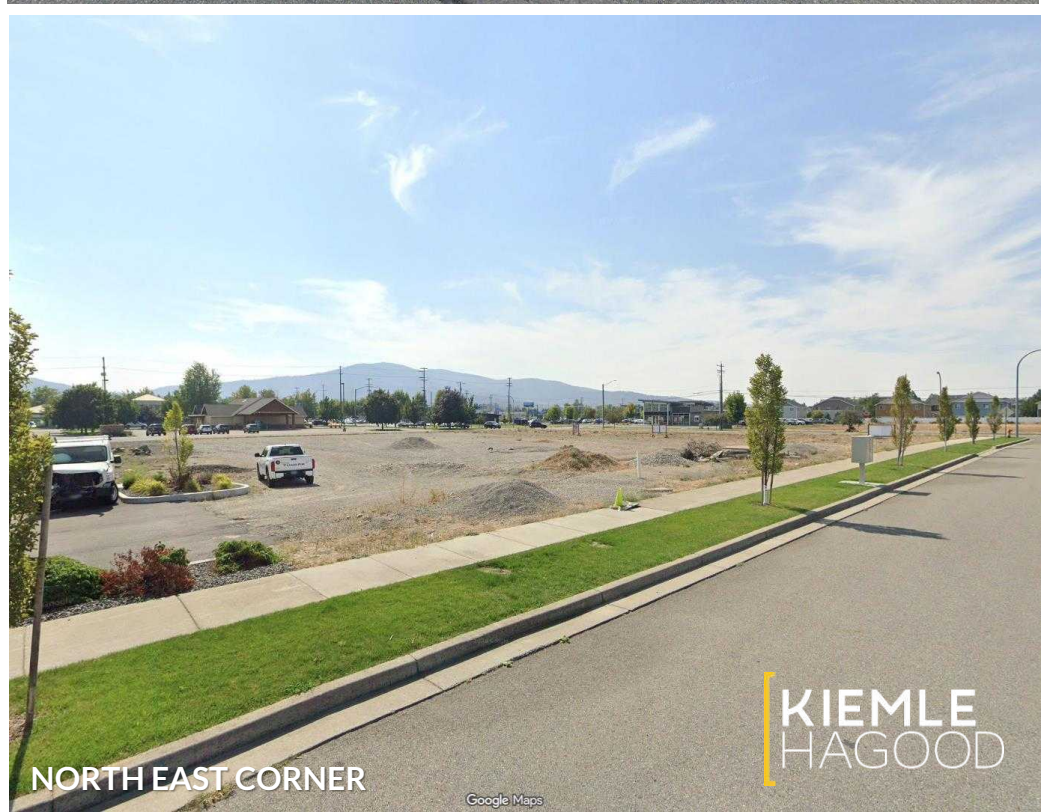
NORTH EAST CORNER