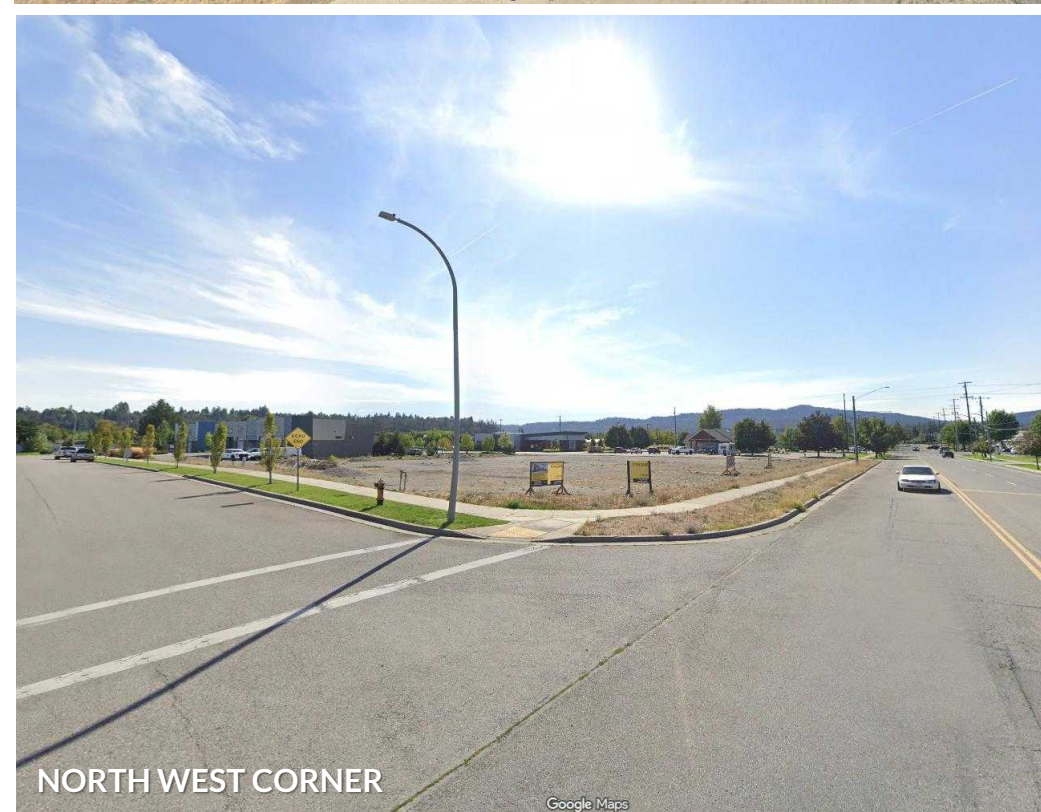
NORTH WEST CORNER