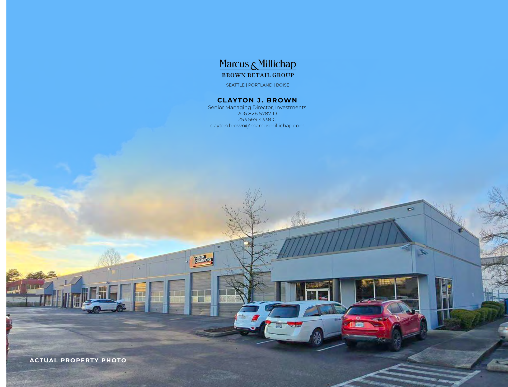
ACTUAL PROPERTY PHOTO