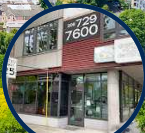
Greenlake Kids Dentistry