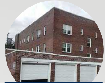
448 Ravenna Blvd