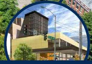
Roosevelt Light Rail (.4 miles)