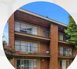
4 th on Greenlake (2)