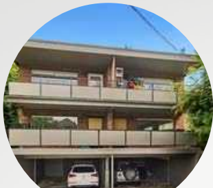
4 th on Greenlake (1)