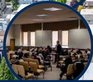
The Church in Seattle