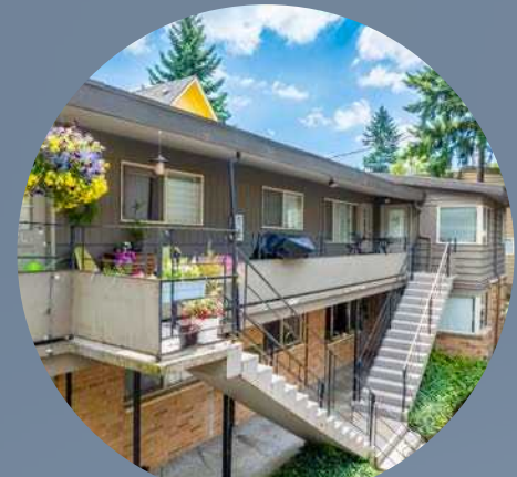
Green Lake Park