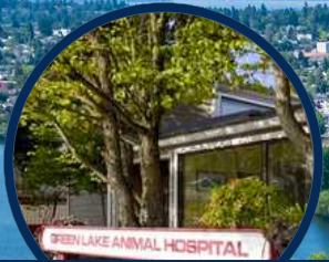
Green Lake Animal Hospital