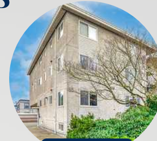
617 N 49 th St