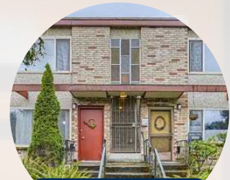
1003 N 50 th St