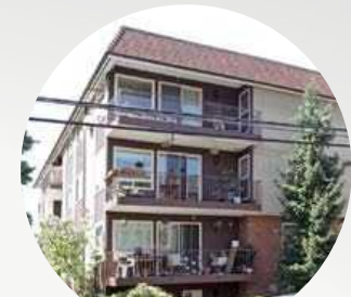
5th Ave Manor