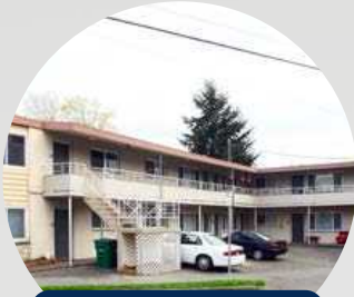
400 NE 65 th St