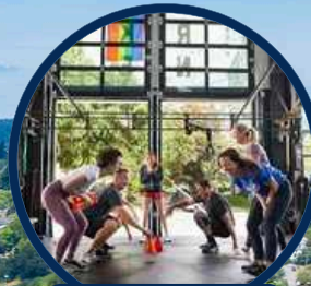
Green Lake Strength & Conditioning