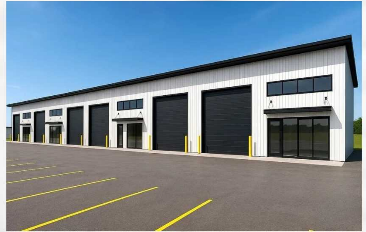
*A hypothetical rendering of a storage complex showcasing its potential design and layout*