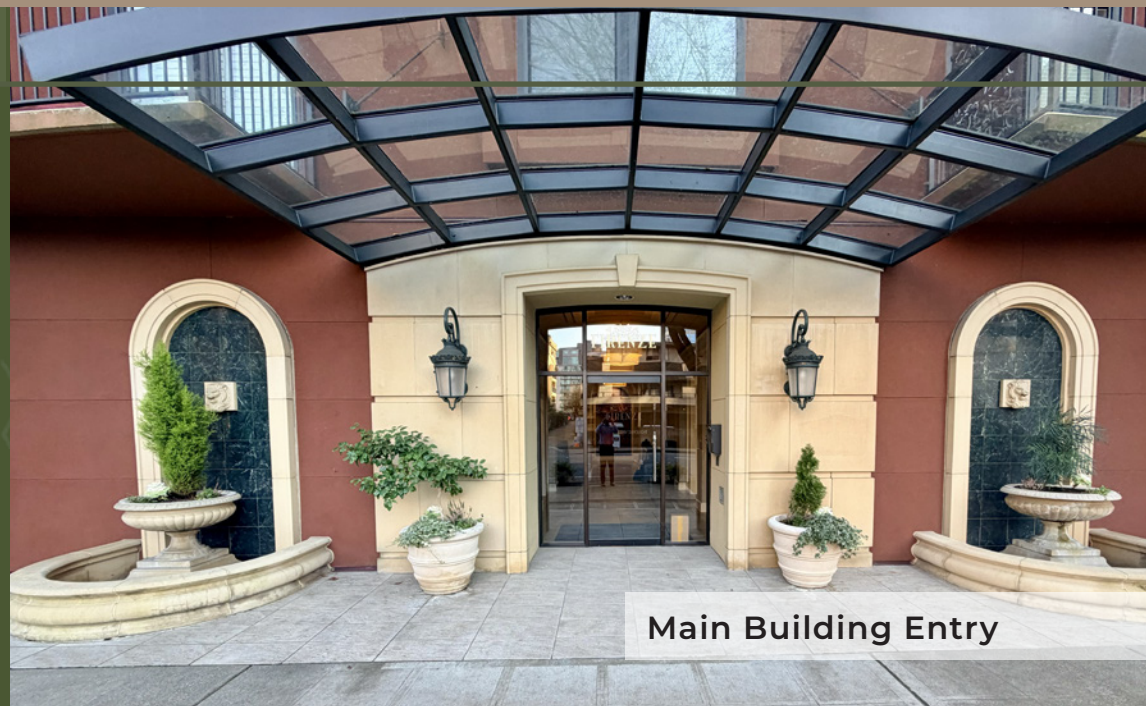
Main Building Entry