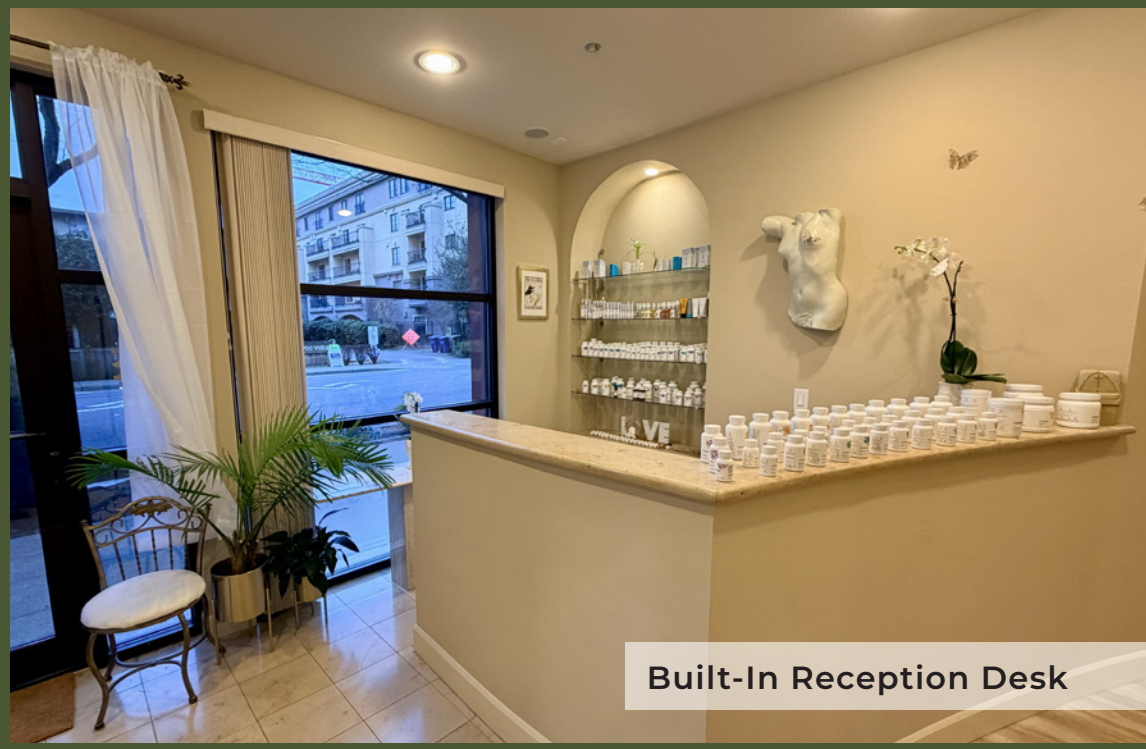
Built-In Reception Desk