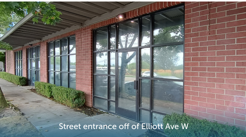
Street entrance off of Elliott Ave W